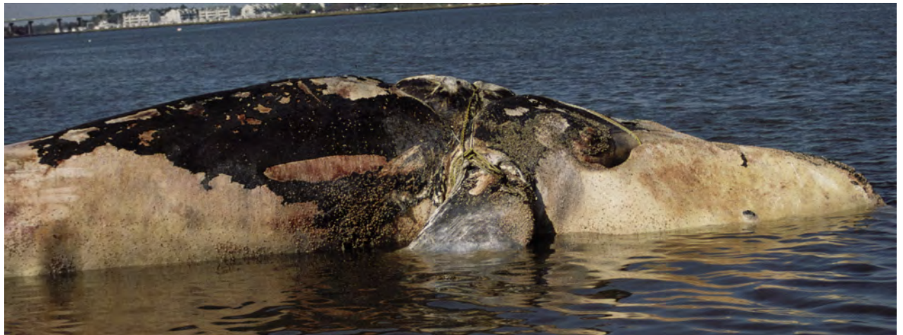
21 Oct 1999 NEA