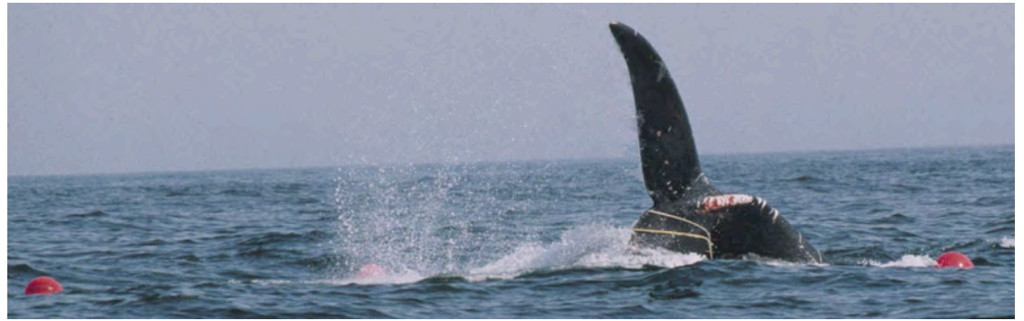
4 Sep 1999 NEA