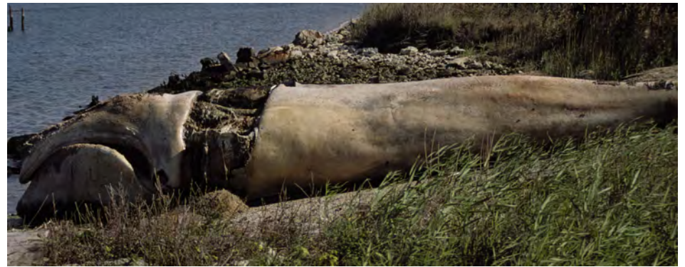
21 Oct 1999 NEA