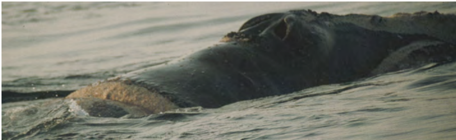
4 Sep 1999 NEA